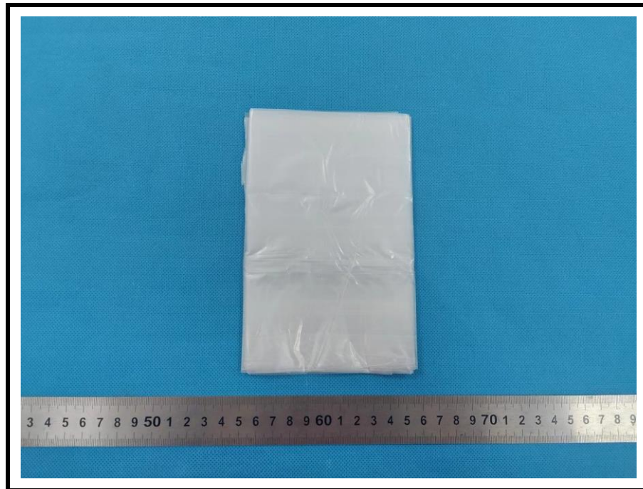
Photograph of Sample

BACL authenticate the photo on original report only